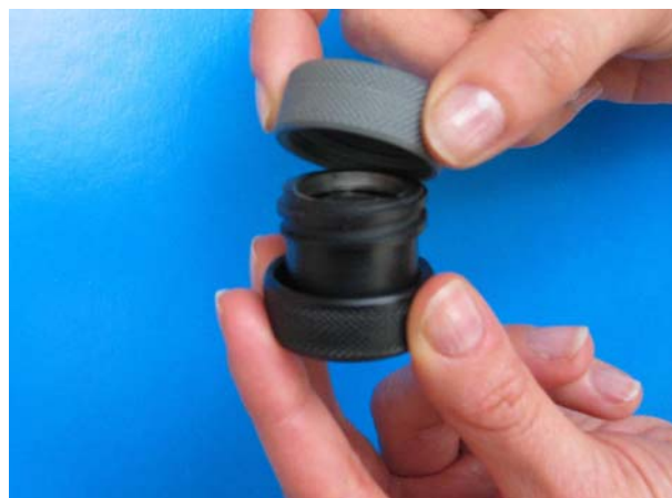
Fig. 2 At the end of sampling cap 2 is removed and optical density is measured

Before and after sampling the windscreen is replaced with the black polyethylene cap (cap 1 in Fig. 1). Silver nitrate impregnated filters were prepared by soaking paper filters in 2% \text{AgNO}_3 , 8% glycerol in a solution 20/80 of \text{H}_2\text{O}/\text{HNO}_3 0.01 M. After 5 min of immersion in the solution, the filters were removed and horizontally supported at the edges on parallel glass rods glued to a glass plate and then dried in an oven at 70^\circ\text{C} . The filters were then stored in a desiccator and protected from light until use. To calibrate the sampler, air streams containing known \text{H}_2\text{S} concentrations, generated by a permeation tube, were diluted with clean air at controlled relative humidity (Humicon-D.A.S., Palombara Sabina, Italy). The permeation tube was placed in a thermostatic bath at controlled temperature to within \pm 1^\circ\text{C} in the range 20 – 40^\circ\text{C} . By varying the operating conditions (e.g., type of permeation tube, temperature) concentrations ranging from about 50 to 1,300 \mu\text{g m}^{-3} could be obtained. The mean concentrations of \text{H}_2\text{S} during the different exposure times