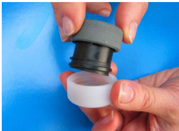
Fig. 3 Cap 1 is removed when in operation and substituted by a windscreen